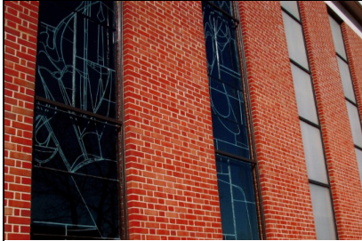
Another Frei project. The windows on the left are now protected with new clear material. The windows on the right still have the clouded Lexan covering.

dirt and rusting of steel frames. It also contributes to the deterioration of the wood frames. Many institutions throughout the country are faced with this project of replacing window covering with newer material that is strong but will remain clear, keeping the window glass protected from damage and sealed against weather.